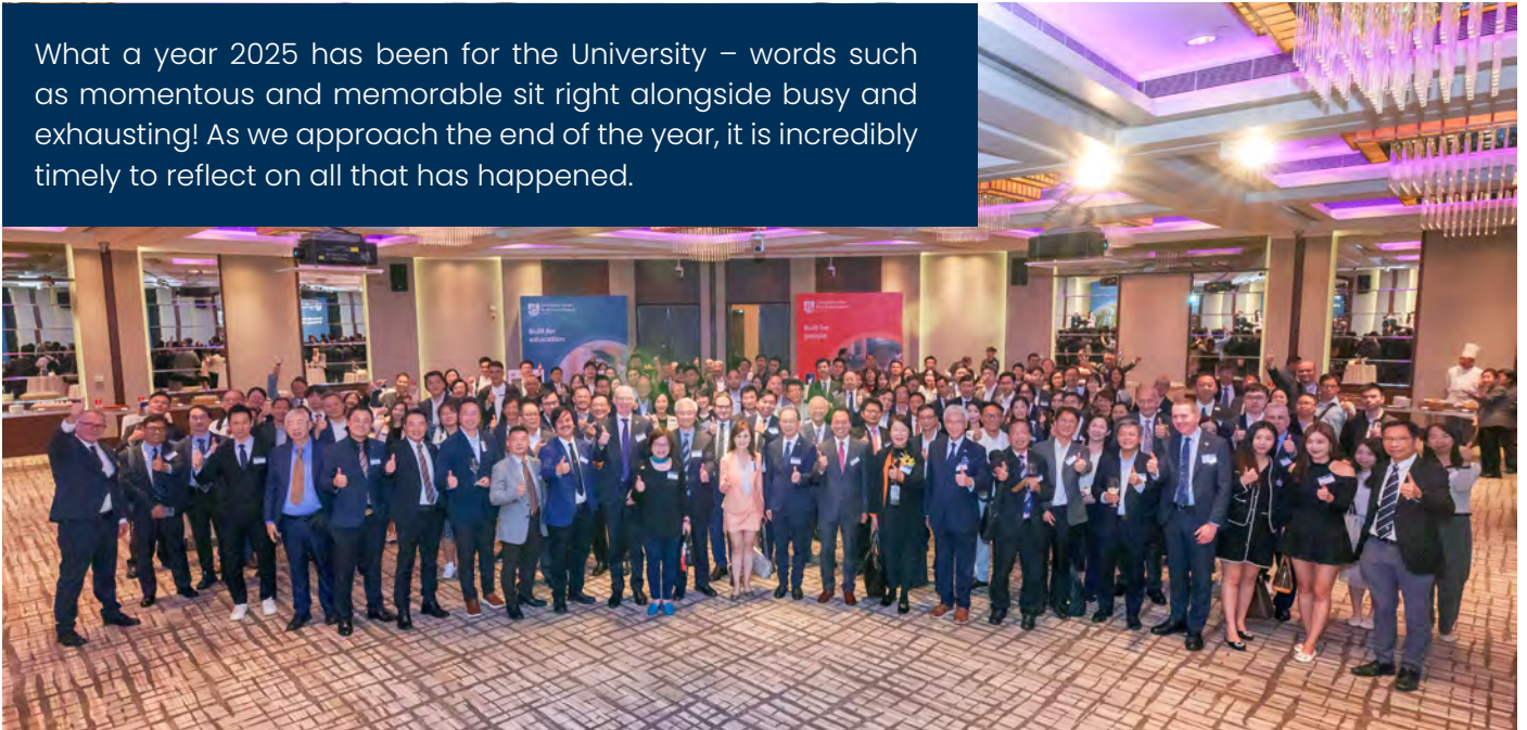
All the guests at the Hong Kong University name launch event

What a year 2025 has been for the University – words such as momentous and memorable sit right alongside busy and exhausting! As we approach the end of the year, it is incredibly timely to reflect on all that has happened.