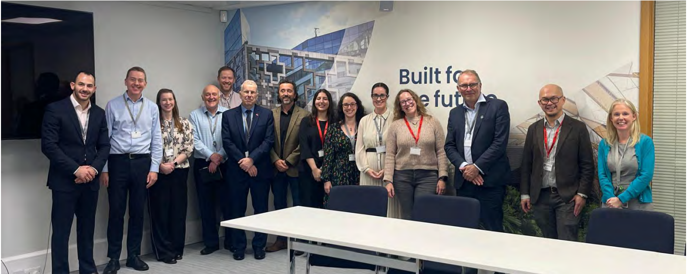
The successful validation team for the MSc Renewable Energy and AI