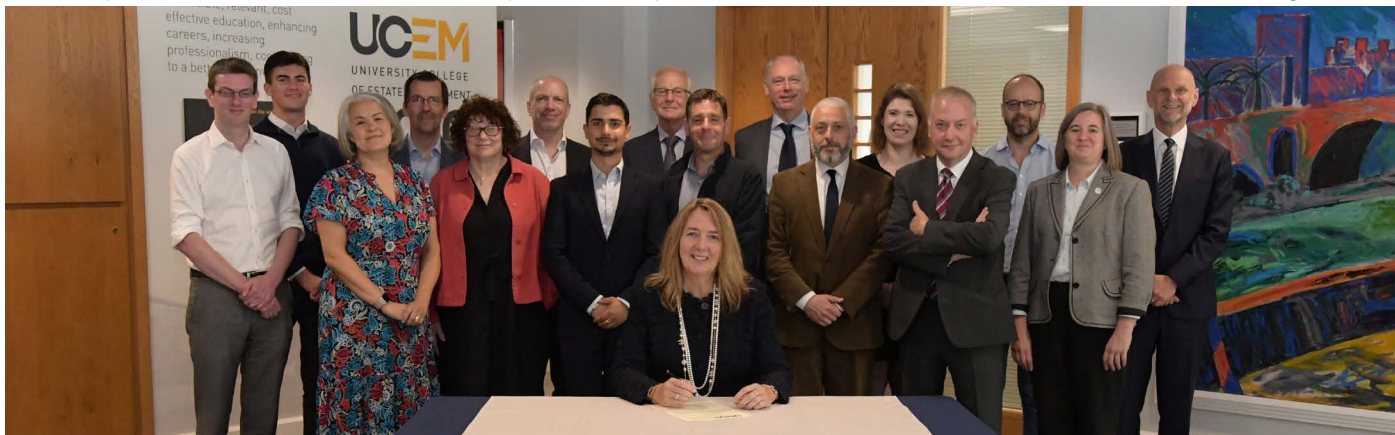
The Board of Trustees resolving in 2024 to apply to the Office for Students to become the University of the Built Environment

deeply connected to our history. But with our new name, we look ahead, committed to shaping the future of the built environment by providing education programmes to meet the needs of the whole sector, including surveying, real estate, construction, sustainability, planning, building control and architecture.