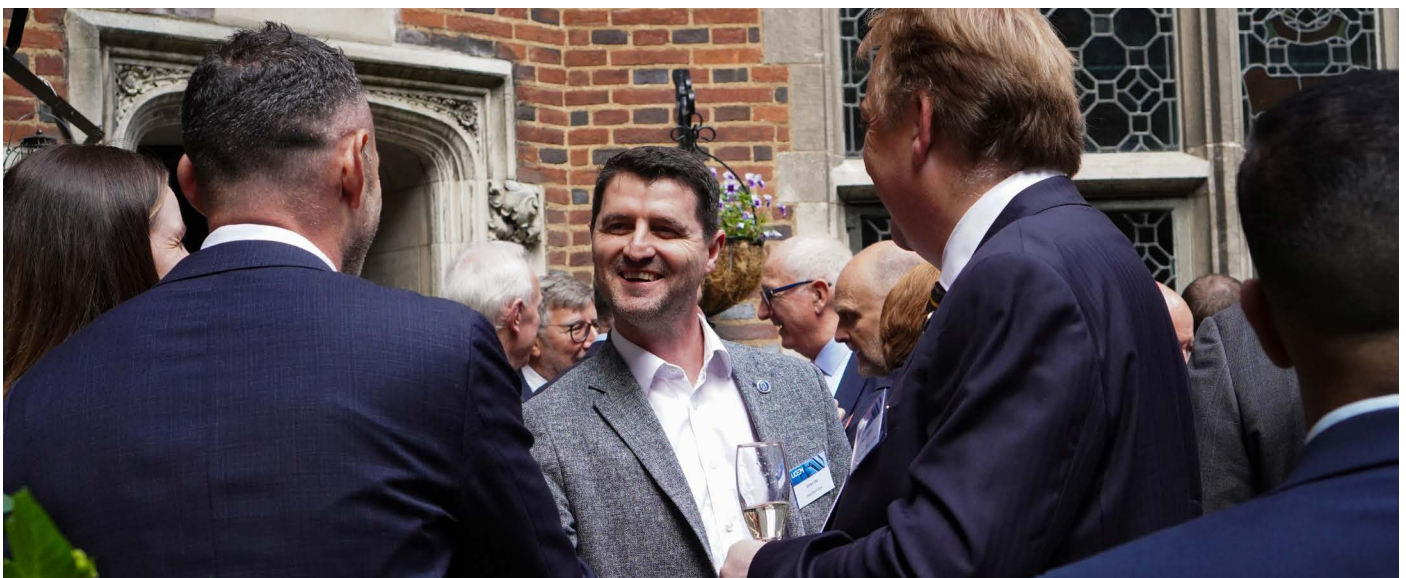
Honorary Community members enjoying the drinks reception