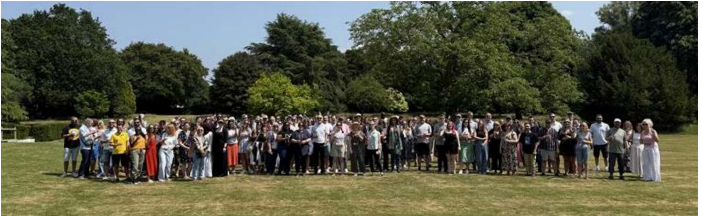
University staff celebrate the new name at their summer barbecue at Shinfield Grange