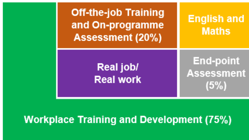
Figure 1 Key components of an apprenticeship

At the core of any apprenticeship there must be a real job with real work activity that relates to the occupation and enables the development of the required knowledge, skills and behaviours. Without this an apprenticeship will not have a positive outcome. As shown in Figure 1, approximately 75% of an apprenticeship is allocated to workplace training and development. A minimum of 20% is allocated to off-the-job training and on-programme assessment.